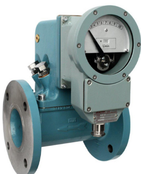
Old TIVG-F with two microswitches Flanged connection