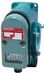
Old TIVG-R with one microswitch Threaded connection

we have actually included more options and features into their new model than we were able to offer before. The aim was of course to keep all important measures of the old model so you can direct replace the old version with the new TIVG-S, without any modifications to the existing pipe configuration at site. We have added a schematic picture below to describe how easy the replacement is.