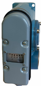
Old TIVG-R with two microswitches Threaded connection